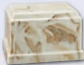
Basic Marble $175