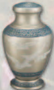
Going Home $205