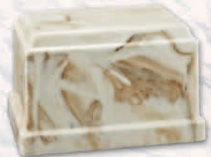
Basic Marble $175