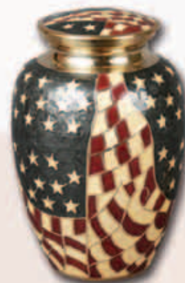
Old Glory $175