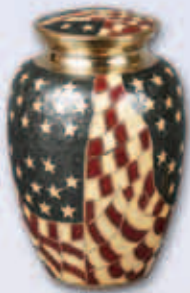
Old Glory $175