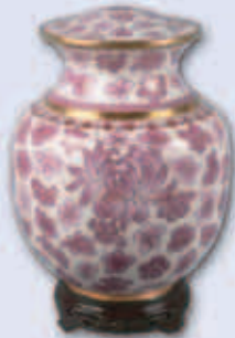
Palace Pink $335