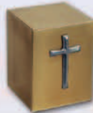
Silver Cross $145