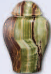
Onyx Vase $195