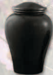
Black Marble $195