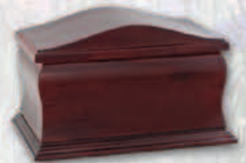
Classic Wood $195

Urn not included - Suggested urn pictured - Choose from our wide selection of available urns.