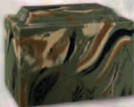
Green Camouflage $175