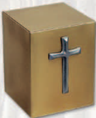
Silver Cross $145