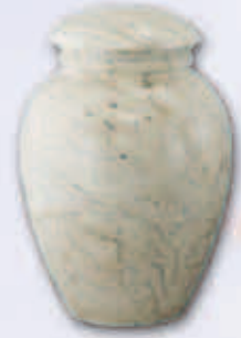
Grecian Travertine $195