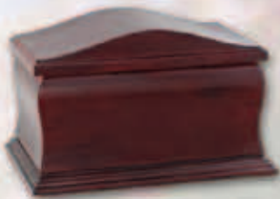
Classic Wood $195